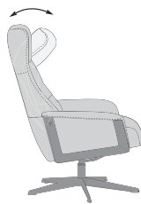
FRICTION BASED HEAD-AND NECK SUPPORT