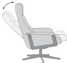
EFFORTLESS RECLINING MECHANISM